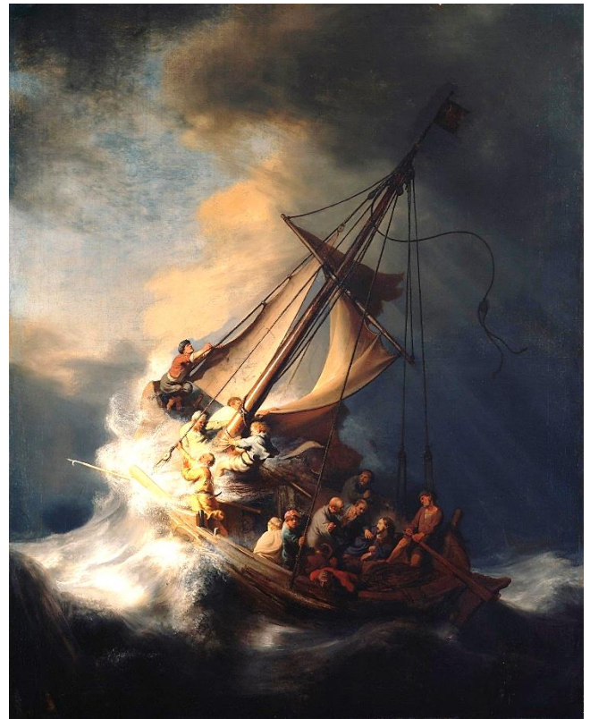
The Storm on the Sea of Galilee by Rembrandt, 1632.