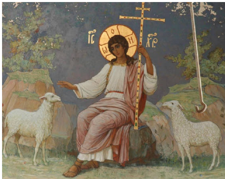
The Good Shepherd (John 10)

OUR FACILITIES, SACRAMENTS, & ACTIVITIES