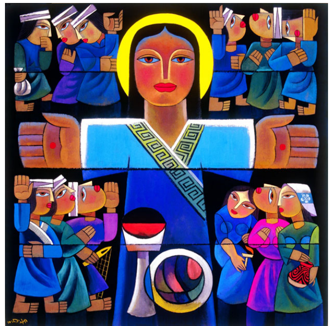
"Risen Lord" (John 20) Painting by He Qi

Public attendance at all Masses is limited during the Covid-19 period. Sunday and daily Masses are live-streamed daily from St Ignatius at 11am (and remain available on line until the next morning) at: http://stignatiusmass.from-ca.com .