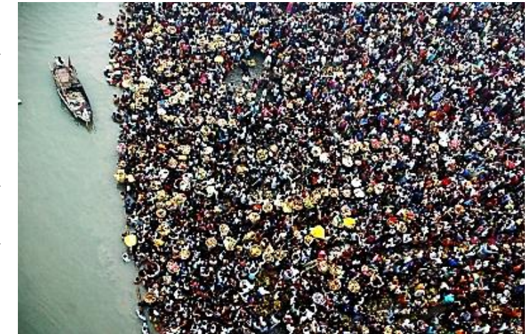
Such great crowds gathered... that he got into a boat... and he told them many things in parables (Matt 13)

19 July 2020 16 th Sunday in Ordinary Time