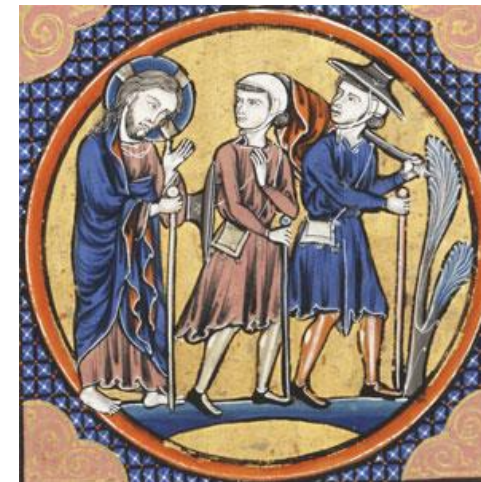
On the road to Emmaus (Luke 24) Illuminated mediaeval manuscript