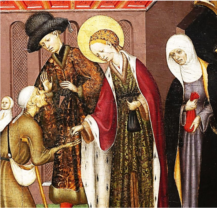
St. Lucy Giving Alms - Bernat Martorell - c1435 Museu Nacional d’Art de Catalunya