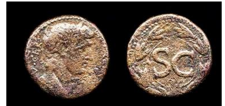
Coin of St Paul's travels: Syrian Antioch, ca48AD

The handicapped washroom, located in the corridor to the Ed Centre is now available for use, and is only for handicapped persons.