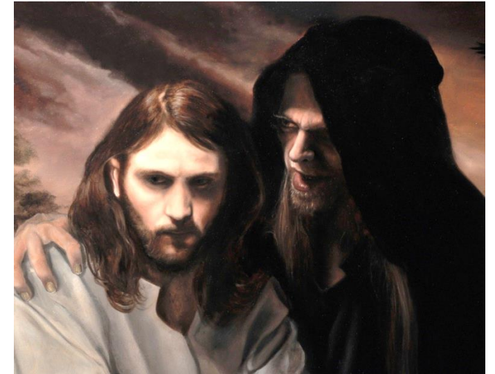
The Temptation of Christ (Luke 4) by Eric Armusik