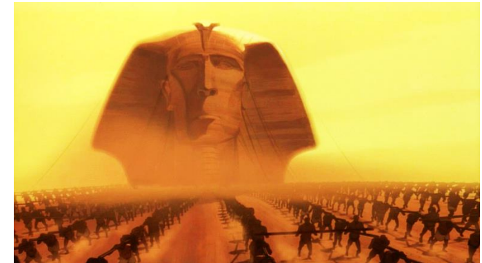
"When the Egyptians... imposed hard labour on us, we cried to the Lord, God of our fathers; the Lord heard us..." (Deut 26)

Share the Journey: Development & Peace Share Lent Campaign. The Share Lent Mini-Magazine is a central part of our Campaign. Here you will learn how partners in Bangladesh, Colombia, Lebanon, Nigeria and the Philippines are working with forcibly displaced people and communities. This week, on pages 6 & 7, we share the journey with members of the Umuechem community in Nigeria. Solidarity Calendars and stickers for your Lenten Jar are still available for pick-up at the back of the church.