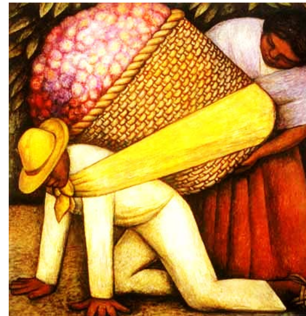
"Come to me, all you that are weary and are carrying heavy burdens..." (Matt 11) "Cargador de Flores", Diego Rivera, 1935

Thanks to everyone who contributed to the African Famine Relief campaign. We collected $2,764. This amount will be matched by the Canadian government.