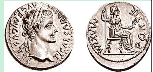
Inscription: "Caesar Augustus Tiberius, son of the Divine Augustus"

In today's Gospel, the Pharisees' henchmen try to trap Jesus by posing an either-or quandary: either recognise Caesar or be faithful to God. By merely handling the denarius used for Roman taxation, they were already complicit with Rome and its idolatry – this coin had a "graven image" and referred to the emperor's "divinity." Perhaps Jesus had meditated on Isaiah 45 and took his approach from the prophet's explanation of God dealing with the world. His response tripped up the Pharisees on numerous levels.... The final answer is that everything – even Caesar and Cyrus – belongs to God. God's word is intended to lead us beyond our limited, self-aggrandizing dogmatism to recognize the image of God in human persons, including those who do not share our theology. Jesus, with some humour, calls us to remember what it means that we ourselves belong to God and only to God.... Men and women are the true images of God (Gen 1:27). Giving a day's wage to Caesar then becomes no big deal. The real question is whether you are ready to give your very self to God.... Consequently, there are not two separate worlds we live in, only one: "what belongs to God."