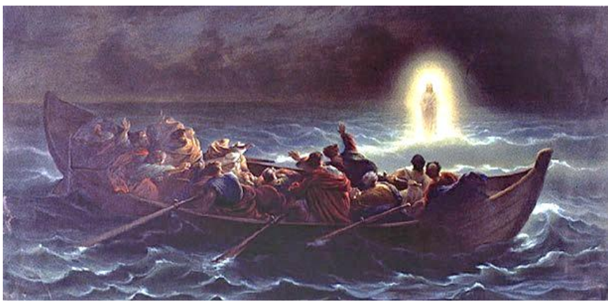
Christ Walks on the Water (Matt 14) by Amédée Varin, French (1818-83)

Please click underlined words below to go to: REFLECTION ANNOUNCEMENTS FINANCIAL REPORT TREATY 1 ACKNOWLEDGEMENT OUR FACILITIES, SACRAMENTS & FORMATION