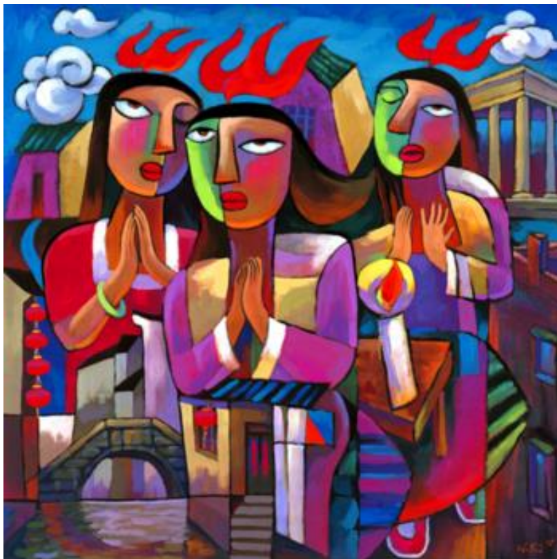
"Holy Spirit Coming," Painting by He Qi