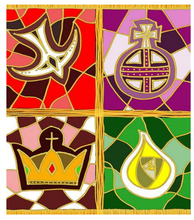
Symbols of Christ the King

(and remain available on line until the next morning).