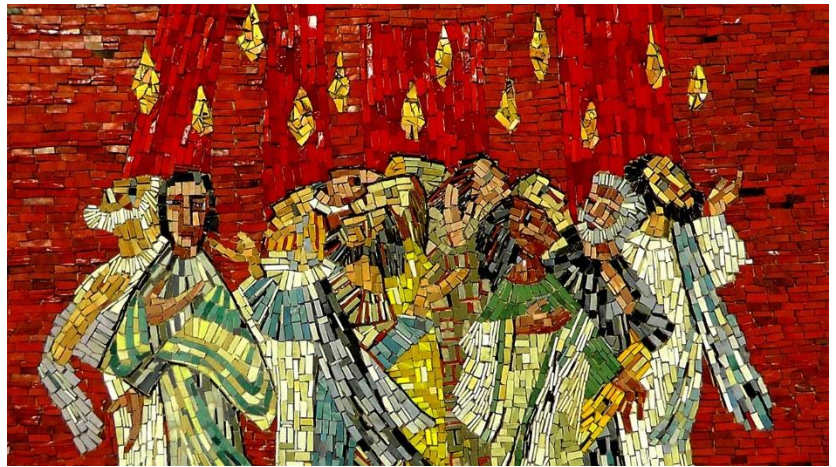
Pentecost (Acts 2) 20 th C Mosaic

Please click underlined words below to go to: