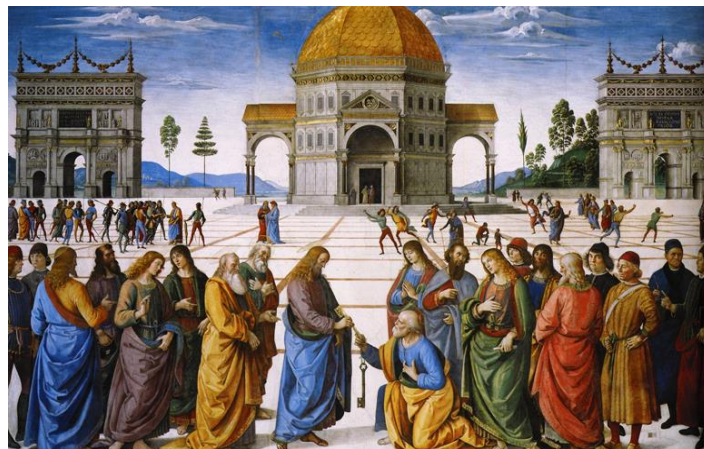
Christ handing the keys to St Peter, by Pietro Perugino, c 1482