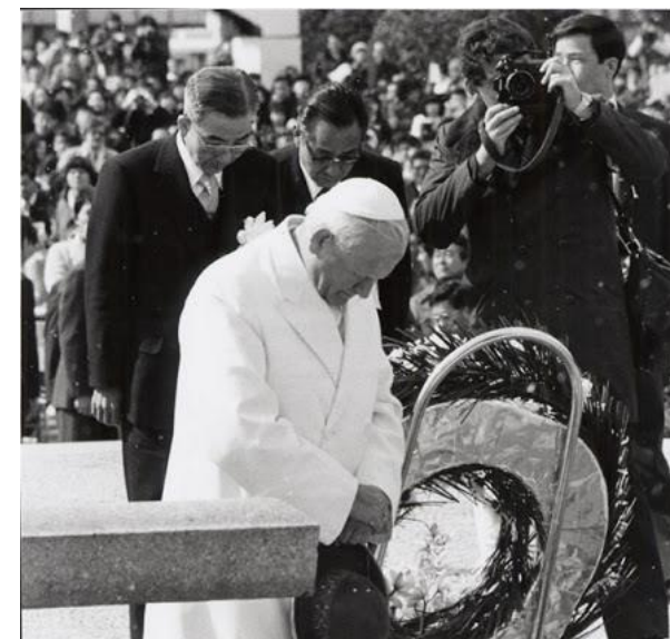
Pope St John Paul II at Hiroshima, 1981