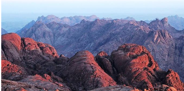
A view of Mount Sinai (photo)