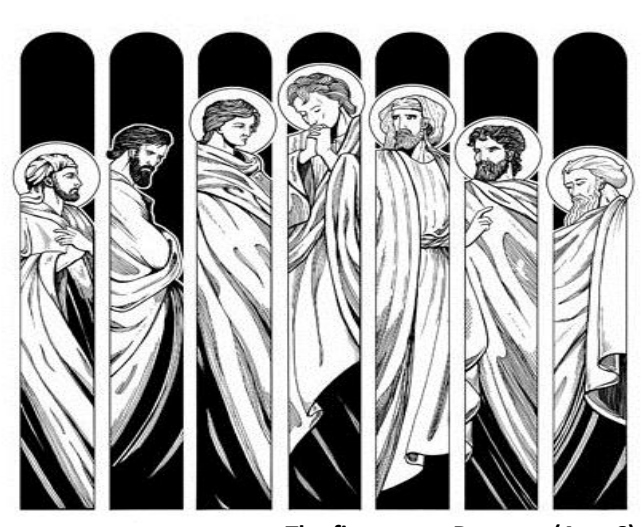
The first seven Deacons (Acts 6)

City of Winnipeg Construction May 2020 to October 2020: Corydon Avenue – Thurso Street to Stafford Street. On-street parking will be prohibited, and traffic will be restricted to one lane in each direction. The work will be completed in multiple stages. Closures of side streets and approaches will be required at different times. Any questions regarding this construction contact Derek.Wiebe@Stantec.com or 204-292-6415.