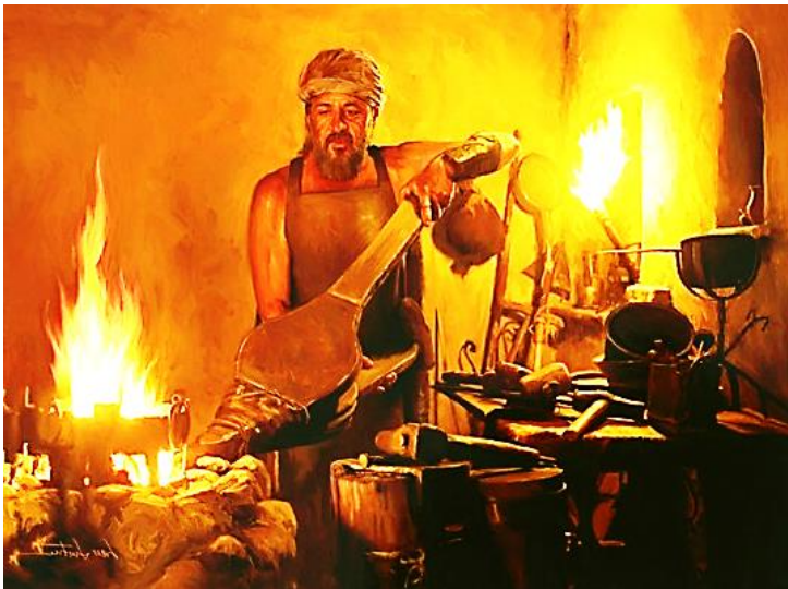
“He is like a refiner’s fire... he will purify... and refine them like gold and silver...” (Malachi 3)