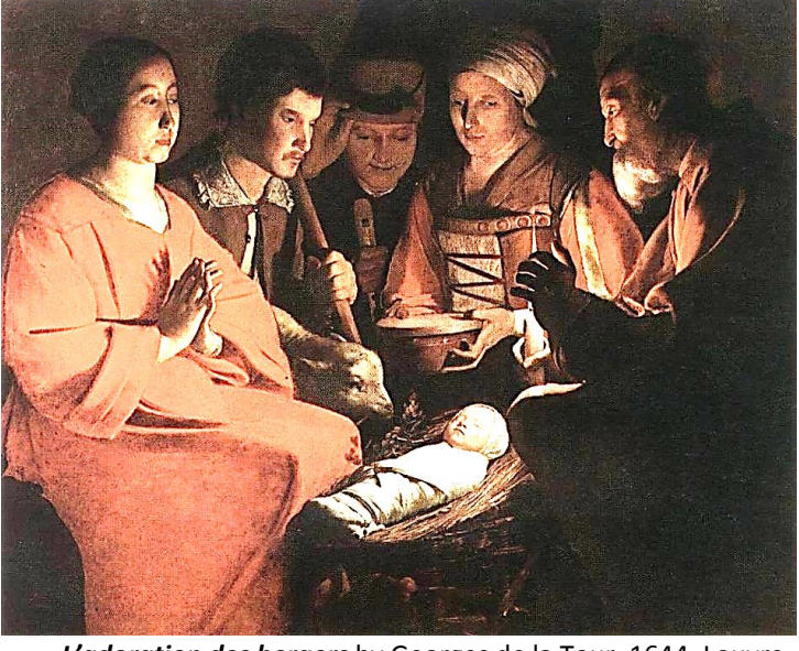
L'adoration des bergers by Georges de la Tour, 1644, Louvre