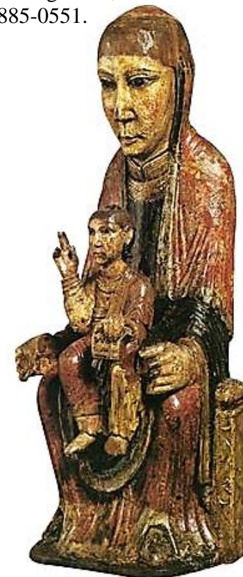
12thC-Romanesque Virgin , Museo Nacional de Arte de Cataluña, Barcelona