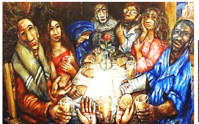
"The Pharisees asked: 'Why does [Jesus] eat with tax collectors and other sinners?'" (Matt 9).

Christmas Bazaar December 1 9a -5p to raise funds for Youth Mission. Donations of food and craft Items appreciated.