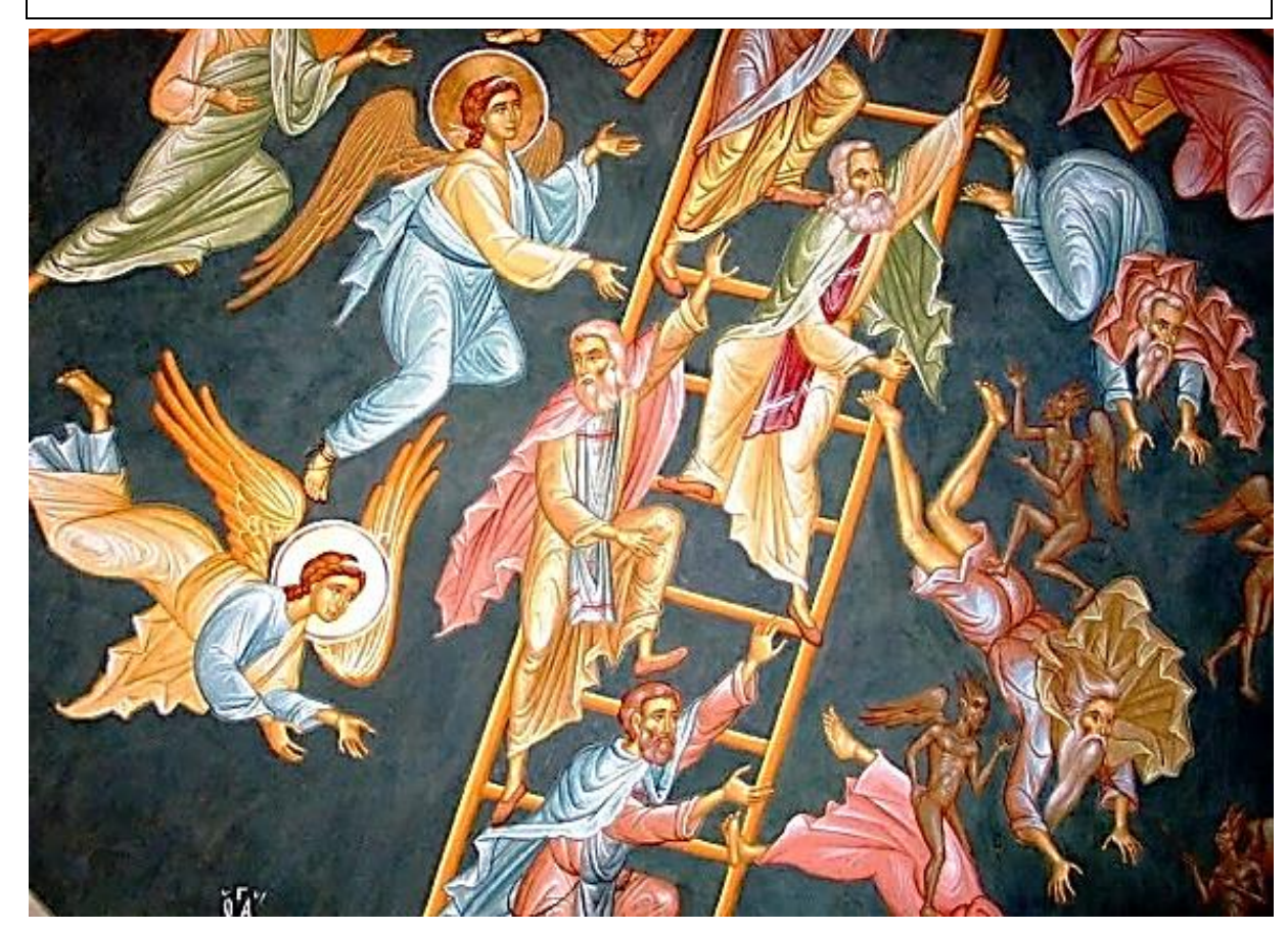
"Some are last who will be first, and some are first who will be last." (Luke 13)

Please consider using Pre-Authorized Payments (PAC) for your contributions to the church: an easy way to donate. To start a new PAC or increase an existing one, please fill out a form available from the Office.