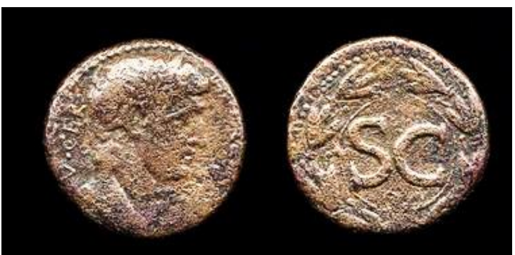
Coin of St Paul's travels: Syrian Antioch, ca48AD

The handicapped washroom, located in the corridor to the Ed Centre is now available for use, and is only for handicapped persons.