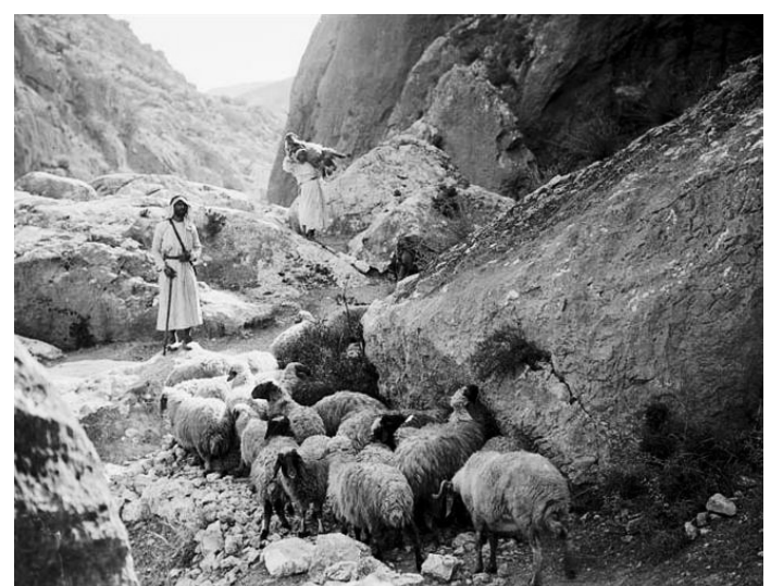
Shepherds in the Middle East.

Please consider using Pre-Authorized Payments (PAC) for your contributions to the church: an easy way to donate. To start a new PAC or increase an existing one, please fill out a form available from the Office.