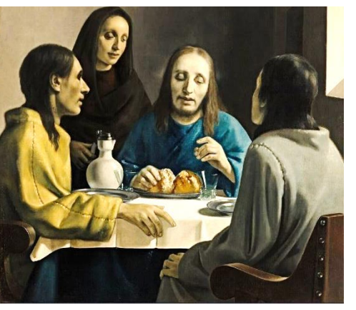
Communion at Emmaus (John 20) by Han van Meegeren – after Vermeer

Thank you for your generous support of D&P's Share Lent Campaign. With additional later contributions, the final tally of your donations was $4,734.