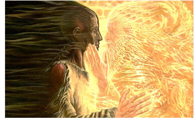
Return of the Prodigal Son (Luke 15) by Oleg Korolev (2005)