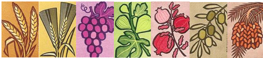
The seven fruits of the land of Canaan: wheat, barley, grapes, figs, pomegranates, olives, and dates (Deuteronomy 8)