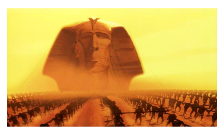
"When the Egyptians... imposed hard labour on us, we cried to the Lord, God of our fathers; the Lord heard us..." (Deut 26)

Share the Journey: Development & Peace Share Lent Campaign. The Share Lent Mini-Magazine is a central part of our Campaign. Here you will learn how partners in Bangladesh, Colombia, Lebanon, Nigeria and the Philippines are working with forcibly displaced people and communities. This week, on pages 6 & 7, we share the journey with members of the Umuechem community in Nigeria. Solidarity Calendars and stickers for your Lenten Jar are still available for pick-up at the back of the church.