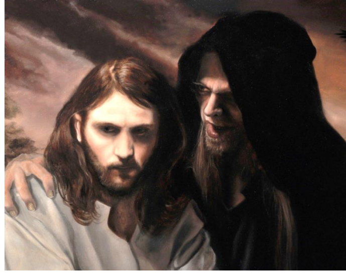
The Temptation of Christ (Luke 4) by Eric Armusik