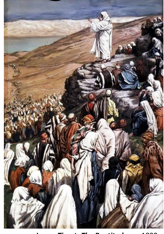
James Tissot, The Beatitudes , ca1890