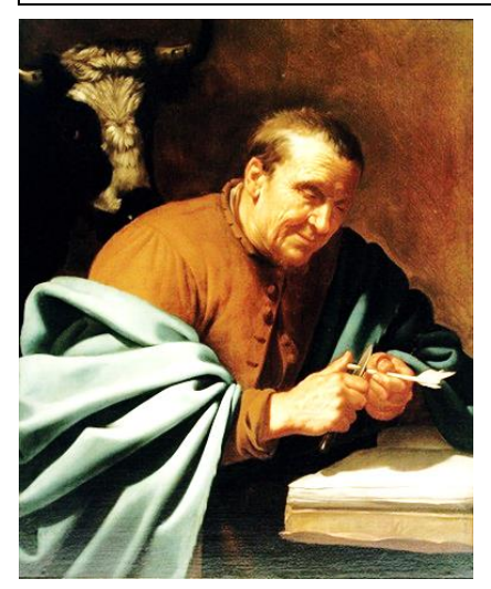
St Luke the Evangelist, by Jan van Bijlert, 17<sup>th</sup> Century

Please consider using Pre-Authorized Payments (PAC) for your contributions to the church: an easy way to donate. To start a new PAC or increase an existing one, please fill out a form available from the Office.