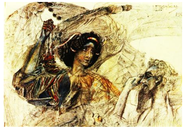
"Then flew one of the angels toward me, holding a live coal... from the altar... and touched my mouth with it..." (Isaiah 6) Painting "The Six-Winged Seraph" by Mikhail Vrubel, 1905