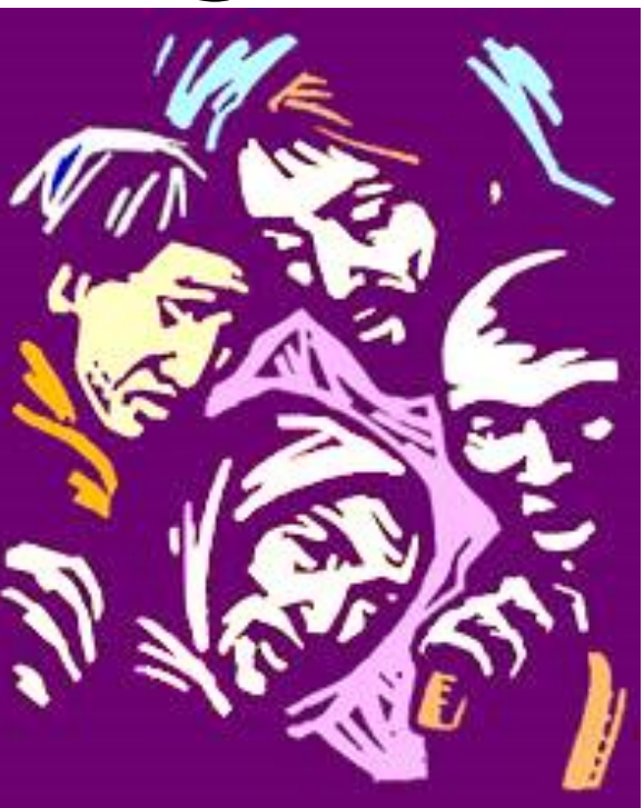
"He has anointed me to bring good news to the poor." (Luke 4 /Isaiah 61)