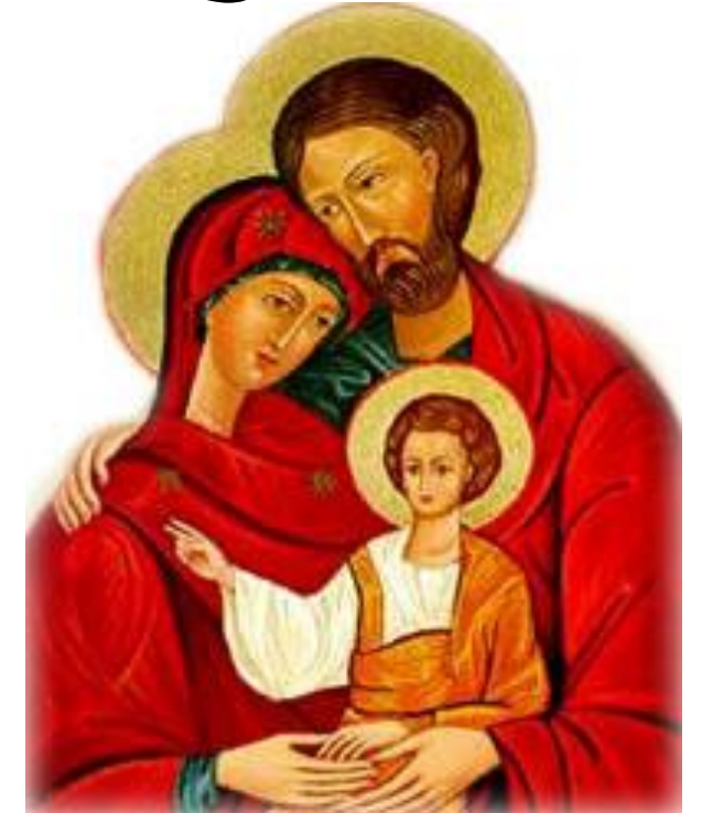
Holy Family (modern ikon)

30 December 2018 Sunday in the Octave of Christmas Holy Family Sunday