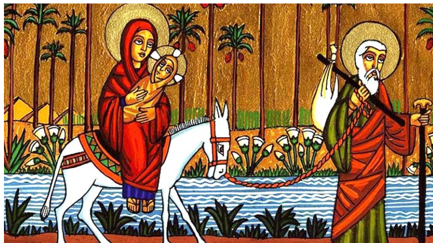
The Holy Family's Flight to Egypt (Coptic style)