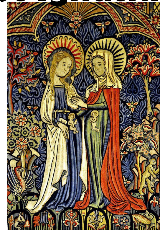
The Visitation Tapestry ca 1410 Museum für Angewandte Kunst-Frankfurt am Main