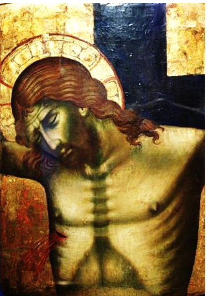
"Out of his anguish, he shall see light" (Isaiah 53) 14<sup>th</sup> C Painting by Paolo Veneziano

Weekly Coffee, Donuts, and Toys Get-togethers have resumed every Sunday after morning Masses. Volunteers are needed to wash dishes after coffee. Please see sign-up sheet.