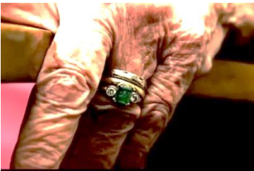
“For this reason a man shall leave his father and mother and be joined to his wife...” (Mark 10)