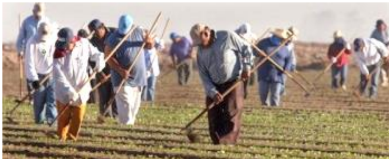
"The wages of the labourers who mowed your fields, which you kept back by fraud, cry out, and the cries of the harvesters have reached the ears of the Lord of hosts." (James 5)