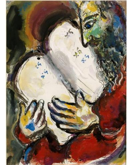
Moses (painting by Marc Chagall)

Philippine Dinner and Cultural Show, Saturday 20 October, more info to follow. Save the date.