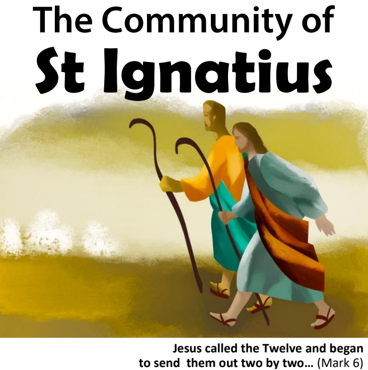
Jesus called the Twelve and began to send them out two by two... (Mark 6)

15 July 2018 15 th Sunday in Ordinary Time