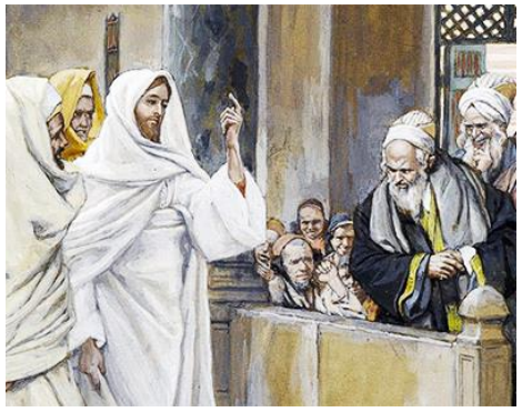
"A prophet is not without honour except in his hometown..." (Mark 6) Painting by James Tissot

Unwanted prescription or non-prescription eyeglasses can be put to good use in low-income countries. To give someone the gift of better sight, bring glasses to the Office any time.