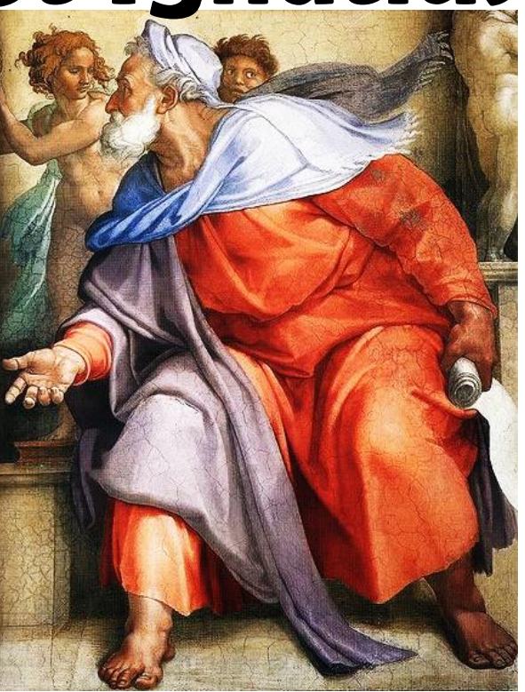
The Prophet Ezekiel, Sistine Chapel, by Michelangelo