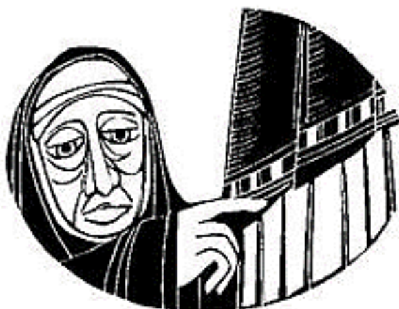
The Haemorrhagic Woman