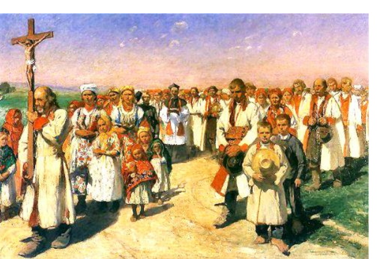
Corpus Christi Procession-in-Bronowicach by Włodzimierz Tetmajer (Polish, 1861 – 1923)

The Ed Centre closes Monday 11 June and reopens Tuesday 4 September. There will be no Adoration of the Blessed Sacrament during this period.