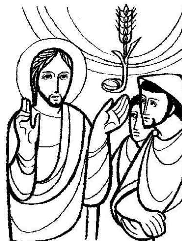
"...but if it dies, it bears much fruit." (John 12)