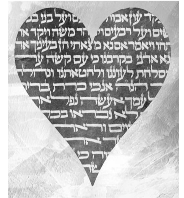
I will put my law within them, and I will write it on their hearts (Jeremiah 31)

18 March 2018 5 th Sunday in Lent Solidarity Sunday