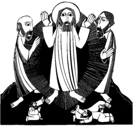
The Transfiguration (Mark 9)

Resist the Federal Government's pressure on NGOs and charities to assent to anti-life policies in a new application for grants to hire youth for summer jobs. This form may adversely affect the work of some faith-based organizations. Please pick up, from the tables at the back of the church, Archbishop Gagnon's letter on this subject, along with a sample of the type of letter you are encouraged to send to your MP to express disagreement with this policy.