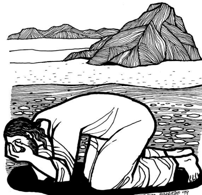
Jesus' 40 Days in the Wilderness (Mark 1)