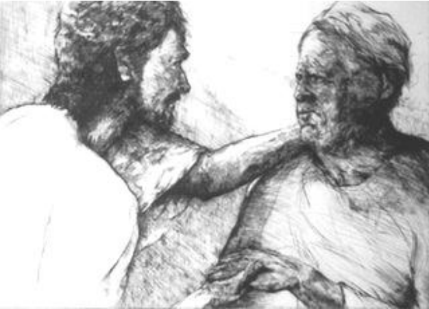
Jesus Touches the Leper (Mark 1)

11 February 2018 6 th Sunday in Ordinary Time World Day of the Sick