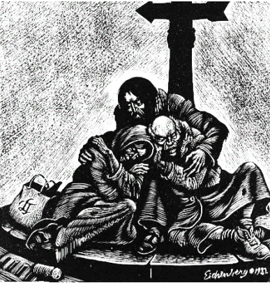
Christ of the Homeless (woodcut by Fritz Eichenberg, 1982)

ST IGNATIUS PARISH 255 Stafford Street Winnipeg, MB R3M 2X2 www.stignatiusparish.ca