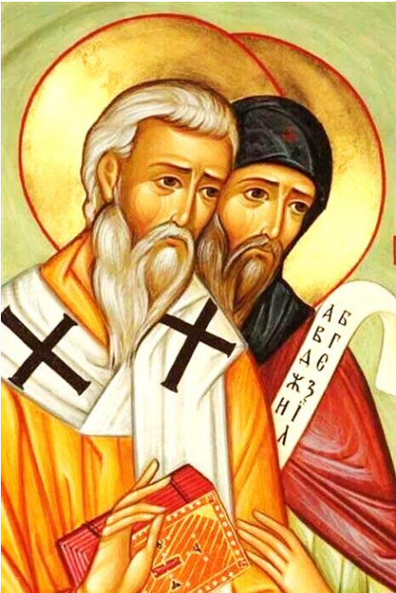
Sts Cyril & Methodius (14 February)

Resist the Federal Government’s pressure on NGOs and charities to assent to anti-life policies in a new application for grants to hire youth for summer jobs. This form may adversely affect the work of some faith-based organizations. Please pick up, from the tables at the back of the church, Archbishop Gagnon’s letter on this subject, along with a sample of the type of letter you are encouraged to send to your MP to express disagreement with this policy.