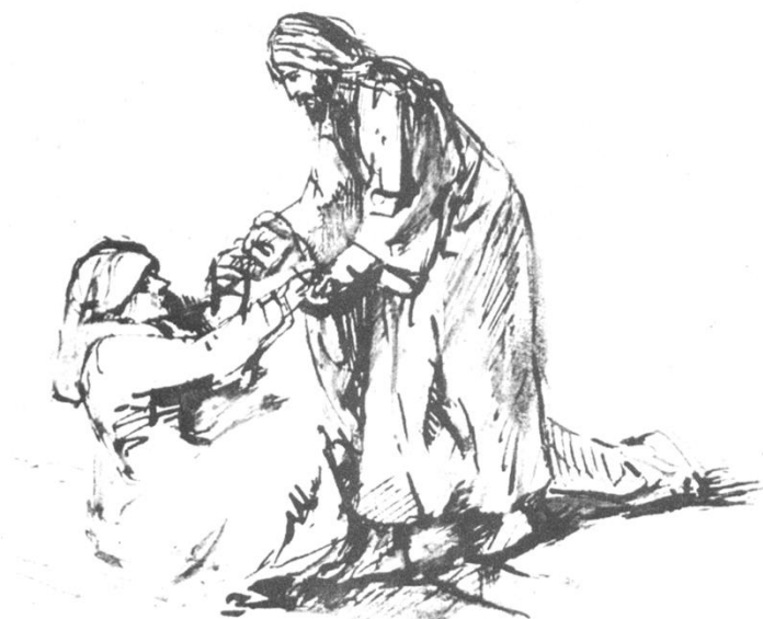
Jesus Lifts up Simon-Peter's Mother-in-Law (Mark 1); Study/Sketch by Rembrandt, 1660

4 February 2018 5 th Sunday in Ordinary Time