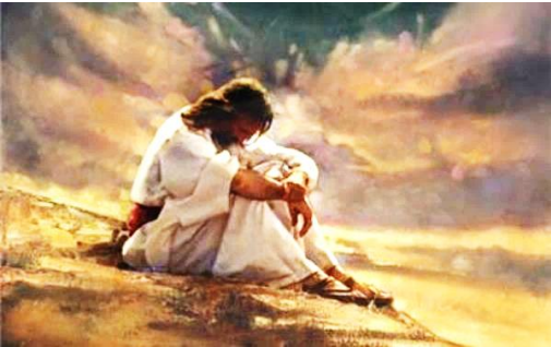
– Celebration (excerpted/paraphrased)

Grace is that experience of going from loss to gain, eyes opened to what we did not see before.... From [a] prayerful interlude in a deserted place, Jesus emerged with a firm resolve to move beyond his home base in Capernaum and minister to all of Galilee. This “man for others” had come ... to give himself and his message to everyone. His itinerant ministry continues to challenge and inspire the church to be less institutional and more mobile, more available and accessible to all.