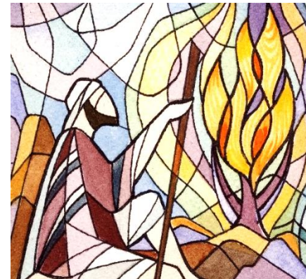
Moses and the Burning Bush

You can give a $5 Tim Horton's card, as an alternative to cash, to the homeless and to those in need. Cards can be purchased from one of the Knights.