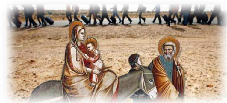
Giotto's Flight into Egypt, & Refugees