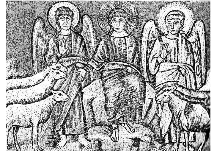
"...he will separate people one from another as a shepherd separates the sheep from the goats" (Matt 25) Byzantine mosaic

26 November 2017 34 th Sunday in Ordinary Time Christ the King