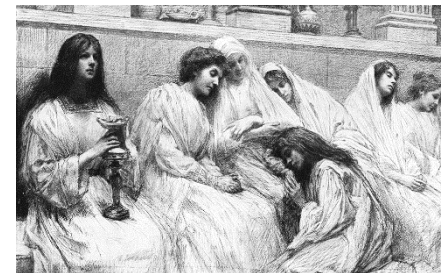
The 10 virgins fall asleep, by Eugène Burnand

Women at the Heart of Peace: Development & Peace (D&P) Caritas Canada education campaign: The vital role women play in conflict-prevention and peace-building in communities around the world. More information about the campaign and how to be a part of it, will be in the mini-magazine/action sheet in your bulletin next week, or go to devp.org/campaign